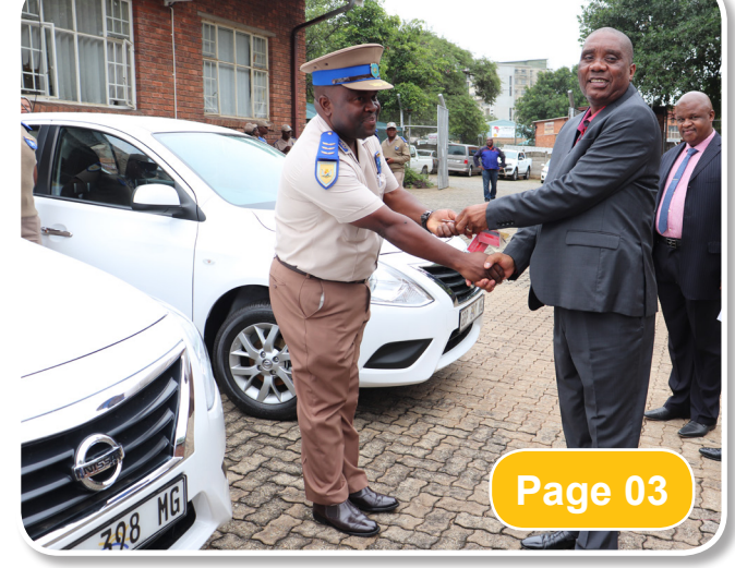
Driving Towards Safer Roads