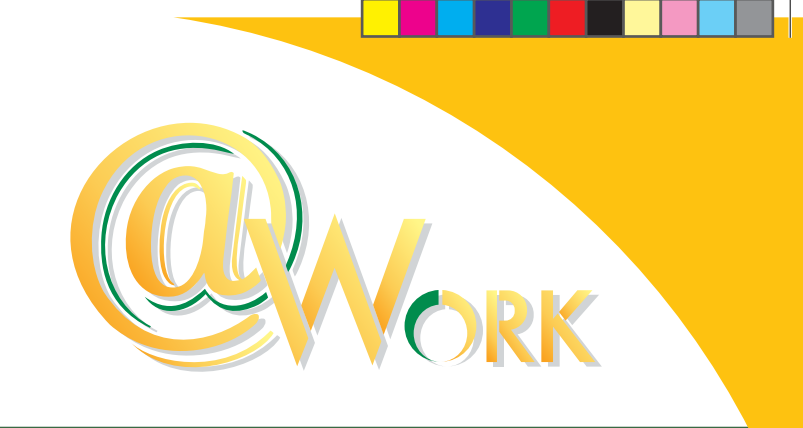
April - June 2019