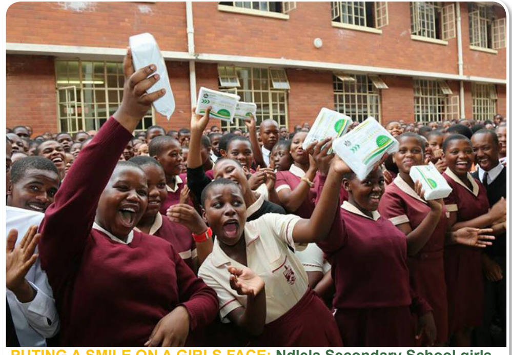
PUTING A SMILE ON A GIRLS FACE: Ndlela Secondary School girls receiving sanitary pads.

he Department joined other government department for an exhibition, when the Ministry of Women and Children in the Office of the Presidency brought back the dignity of school girls by launching the National Sanitary Dignity programme. The event was held at Piet Retief Rugby Stadium on Thursday the 28th of February 2019. Former Minister for Women and Children, Ms Bathabile Dlamini together with the Mpumalanga Premier, Refilwe Mtshweni-Tsipane gave away packs of pads to learners from various schools in the province.