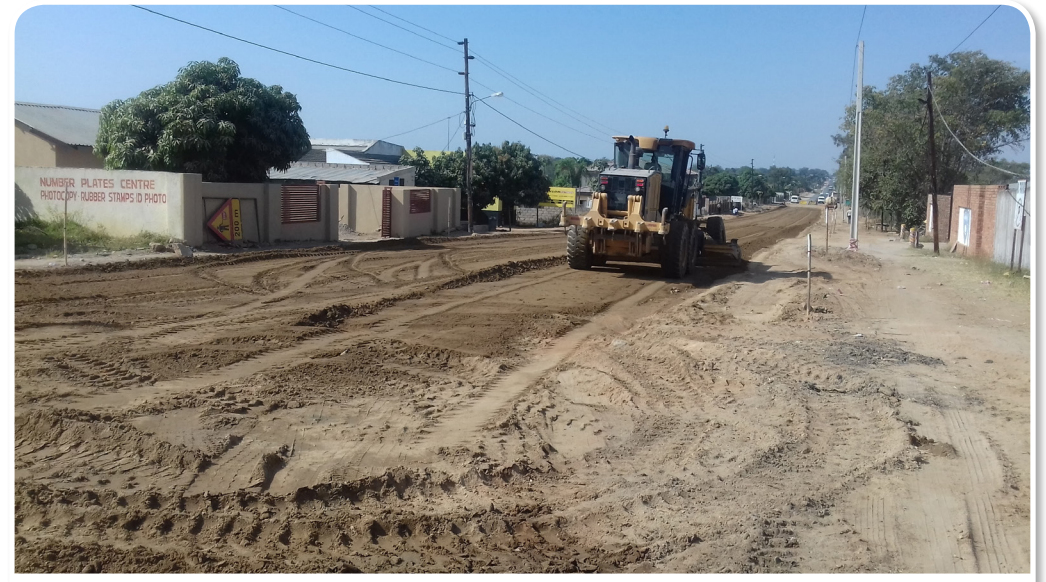
ROAD CONSTRUCTION: Phase two underway from Thulamahashe to Buyisinto.

he rural community of Nkomazi Local Tonga in gained Municipality has great benefits from the Municipal Support Programme implemented by the Department recently. The programme which is coordinated by the Department focuses mostly on roads maintenance and other basic services, aimed at assisting distressed municipalities towards the fulfilment of their mandate.