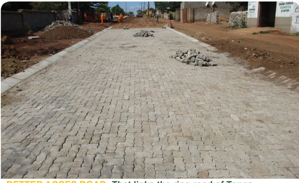
BETTER ACCES ROAD: That links the ring road of Tonga Hospital and D2948.