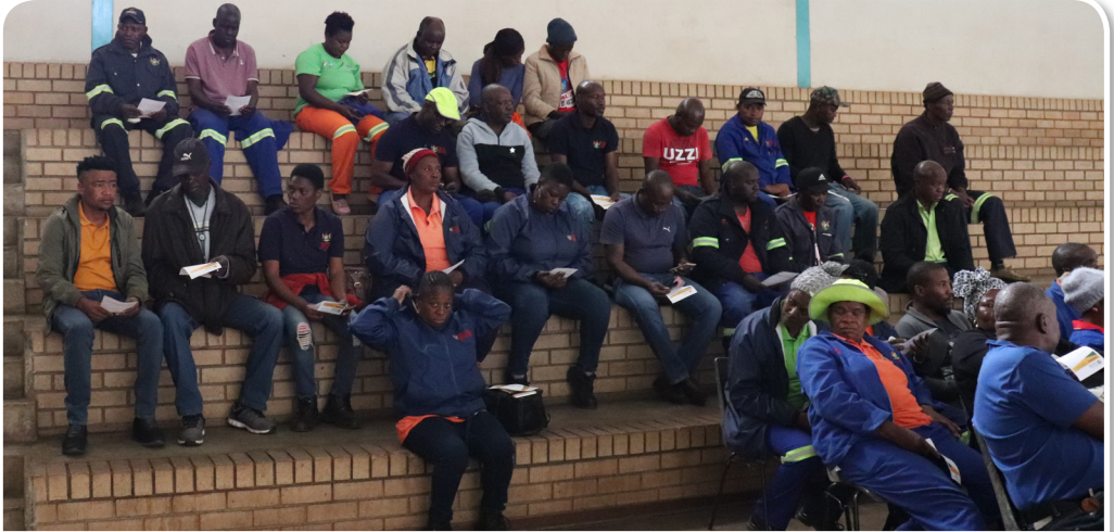
ALL EARS: Sabie Cost Centre,Lydenburg and Mwatibidi staff members.