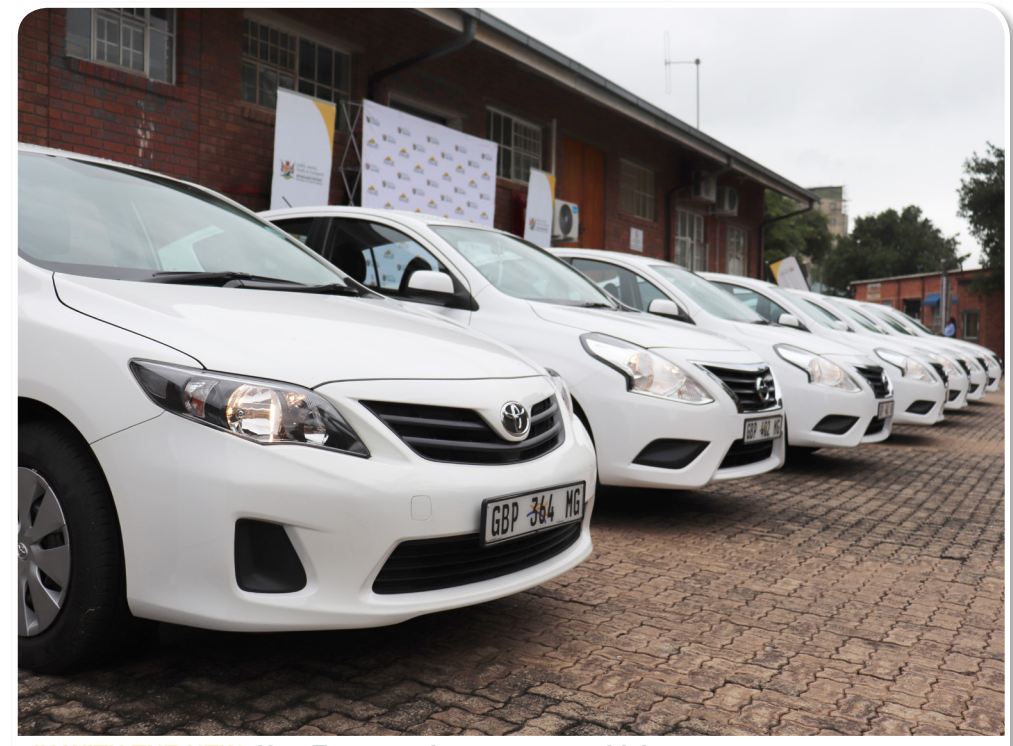
IN WITH THE NEW: New Transport Inspectorate vehicles.

he rainy condition could not irreparable ones. Furthermore, I dampen the mood of the challenge you to change the narrative Transport Inspectorate officials that says law enforcement officers