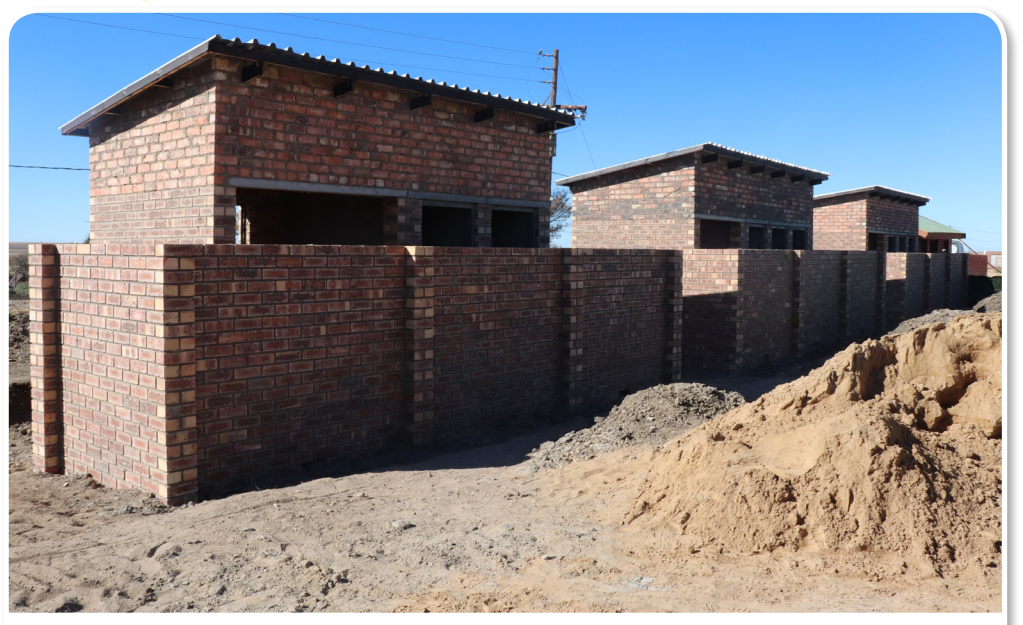
PRIORITIZING HYGIENE: Sanitation project in progress at Vukekuseni Primary School in Lekwa Local Municipality.

unchallenged. "I cannot allow determine the next course the exploitation of our of action," alluded MEC Mashego.