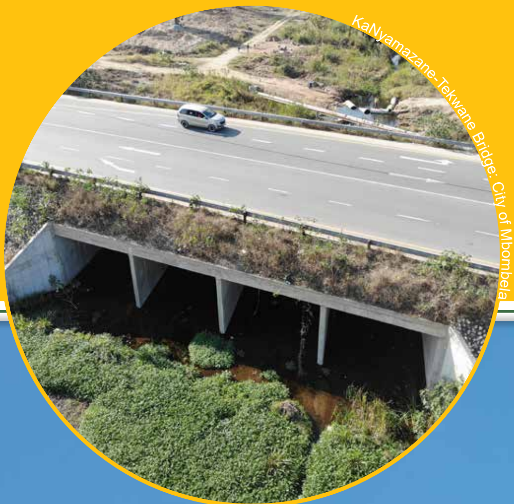
KaNyamazane-Tekwane Bridge: City of Mbombela