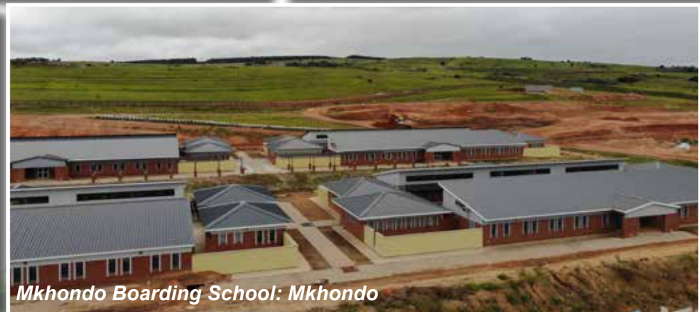
Mkhondo Boarding School: Mkhondo

As the 6th administration closes another chapter of the 30 year democratic rule, Mpumalanga has a good story to tell. "We are resolved not merely to return our economy to where it was before the coronavirus, but to forge a new economy in a new global reality," expressed President Cyril Ramaphosa addressing the nation on the 21st of April 2020 in response to Covid-19 pandemic. At the time, South Africa was 25 days into a nation-wide lock-down to contain the spread of the coronavirus. The President cited the unimaginable devastation of the pandemic which he said has disrupted lives and damaged the economy. More than 102 000 South Africans succumbed to the deadly virus, leaving many families in despair. As result, drastic measures were required to cushion the vulnerable, not only as a temporary measure but a permanent solution.