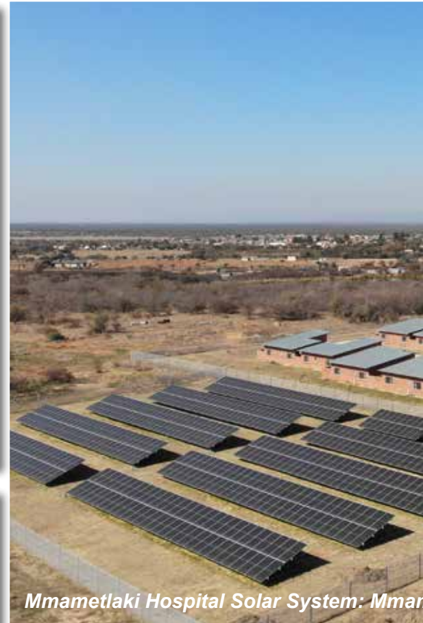
Mmametlaki Hospital Solar System: Mmametlaki