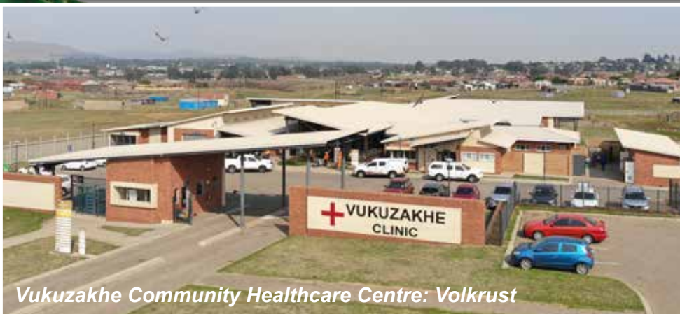
Vukuzakhe Community Healthcare Centre: Volksrust