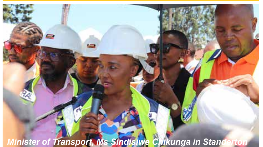
Minister of Transport, Ms Sindisiwe Chikunga in Standerton