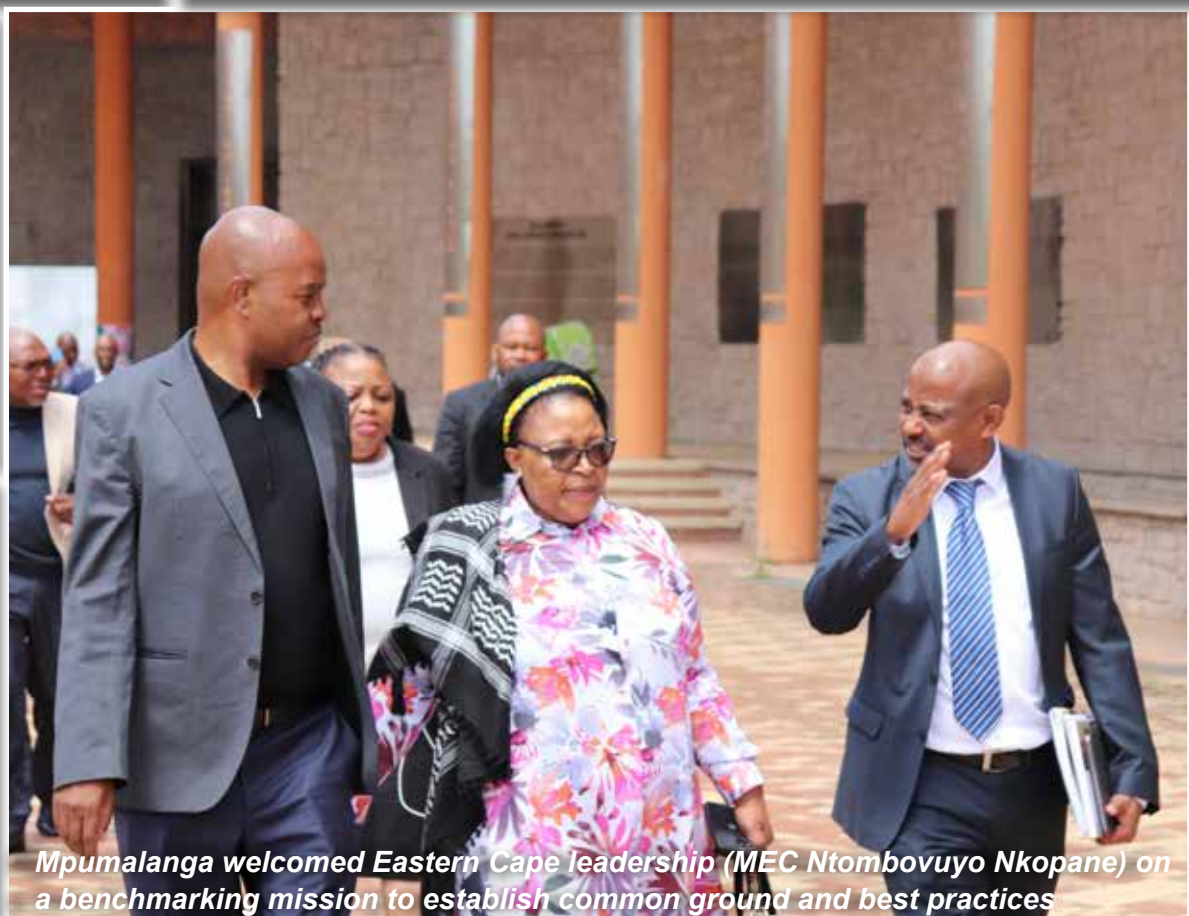
Mpumalanga welcomed Eastern Cape leadership (MEC Ntombovuyo Nkopane) on a benchmarking mission to establish common ground and best practices

through upgrading of rural and township road infrastructure, but also creating strong urban-rural linkages; Support infrastructure that promotes agriculture especially our emerging farmers and build hospitals, clinics, schools and Early Childhood Development (ECD) centres," pronounced Premier Mtshweni-Tsipane during the State of the Province Address (SOPA) on the 5th of July 2019.