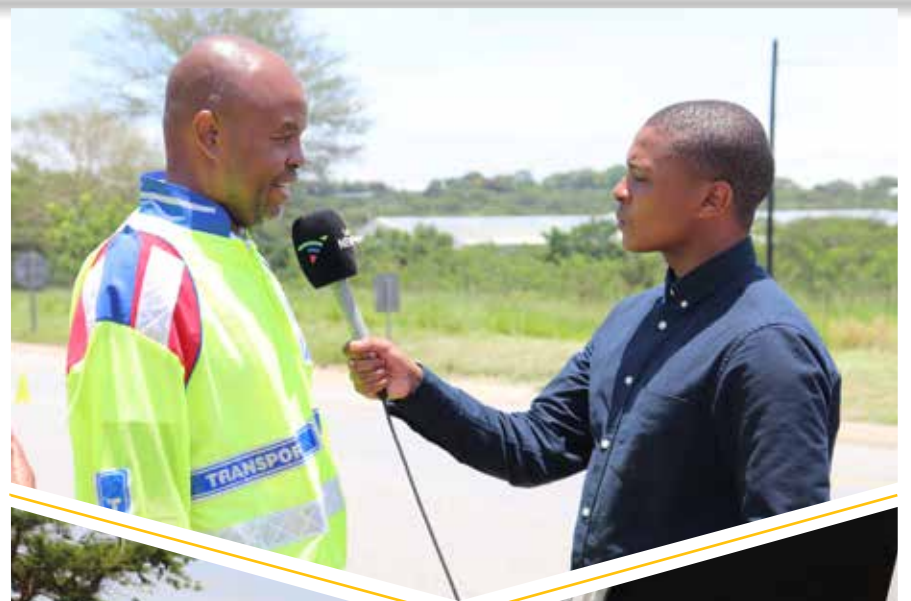
MEC Mandla Ndlovu engaging with commuters

As the custodian of public transport in Mpumalanga, MEC Ndlovu had an opportunity to interact with commuters who raised various concerns but mostly applauded Buscor for exceptional service. The dignitaries also visited Buscor's operational hub including the depot and workshop to get a first hand experience on how the company keeps its fleet fit for the road.