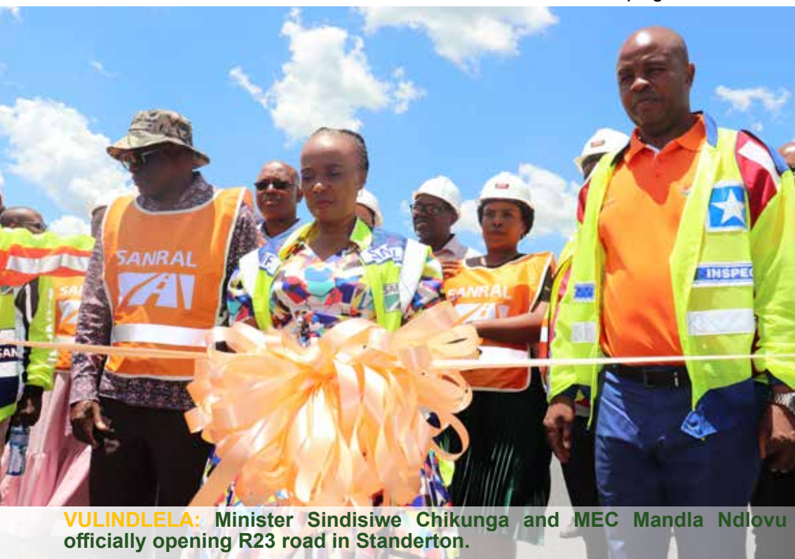
VULINDLELA: Minister Sindisiwe Chikunga and MEC Mandla Ndlovu officially opening R23 road in Standerton.

With the intervention of the South African Roads Agency Limited (SANRAL), Standerton has become a point of reference. Due to high roads maintenance costs competing with the provision of similar critical basic services, the local Government had a mammoth task on its hands that compelled the national Government to come on board. This move proved to be a game changer which has since greatly improved roads condition in this little town which serves as a rest stop for those traveling between the provinces of KwaZulu Natal and Gauteng as well as Limpopo. Most importantly, the local residents are reaping the benefits.