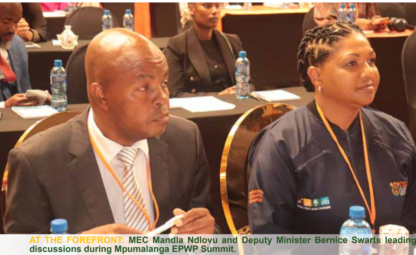
AT THE FOREFRONT: MEC Mandla Ndlovu and Deputy Minister Bernice Swarts leading discussions during Mpumalanga EPWP Summit.

MEC Mandla Ndlovu expressed concerns over the high rate of youth unemployment and called for urgent intervention. “The ever increasing youth unemployment rate remains a concern. With the integration of strategies and identification of youth impactful programmes through