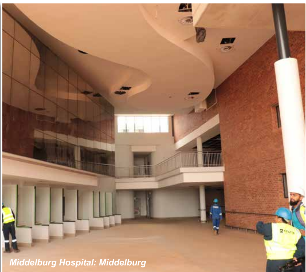
Middelburg Hospital: Middelburg