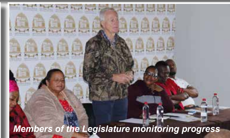
Members of the Legislature monitoring progress