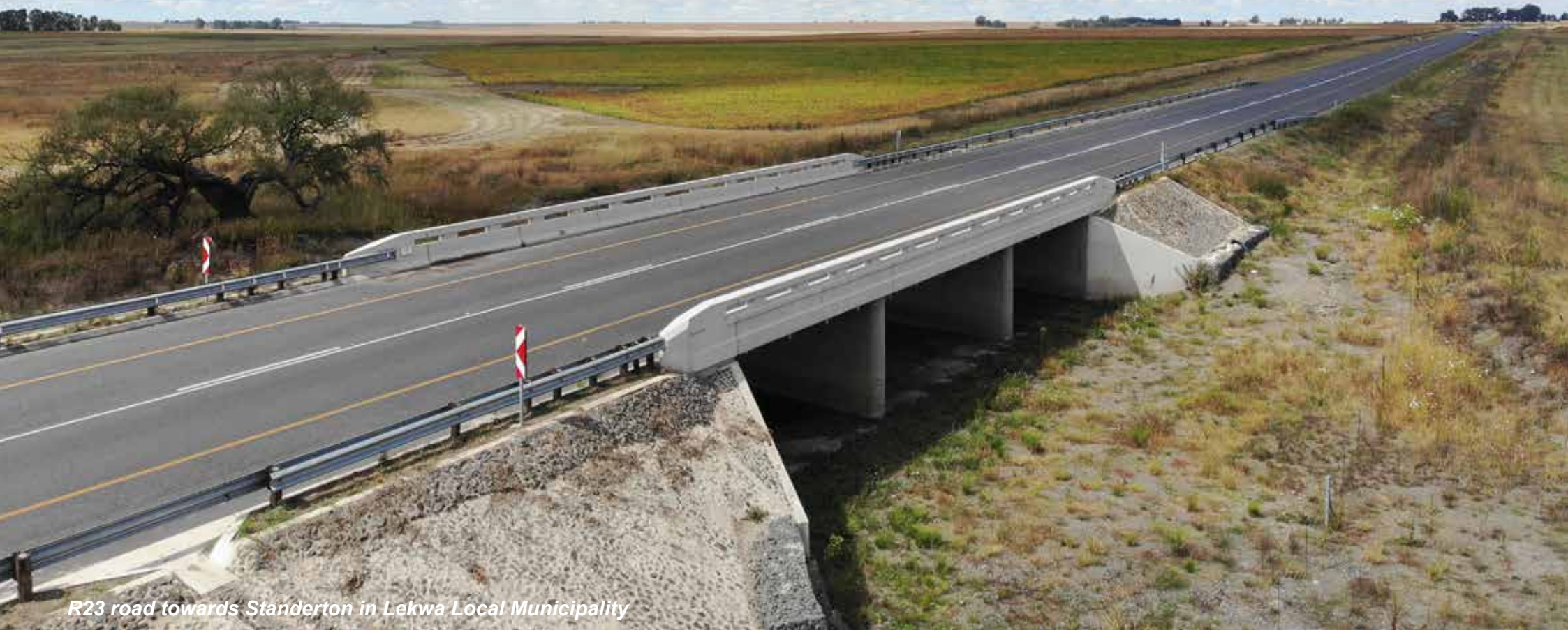
R23 road towards Standerton in Lekwa Local Municipality

In a landmark move for South African infrastructure development programme, the Minister of Transport, Ms Sindisiwe Chikunga accompanied by the MEC of Public Works, Roads and Transport in Mpumalanga, Mr Mandla Ndlovu, officially handed over the completed R23 road project in Standerton, Mpumalanga, on the 5th of February 2024.