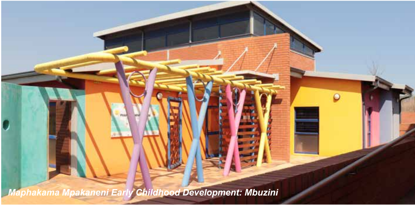
Maphakama Mpakaneni Early Childhood Development: Mbuzini