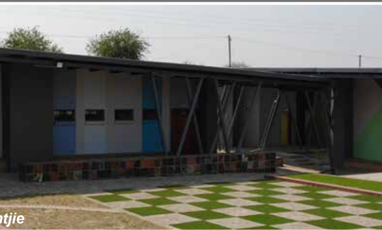
Mamelodi Sports Centre