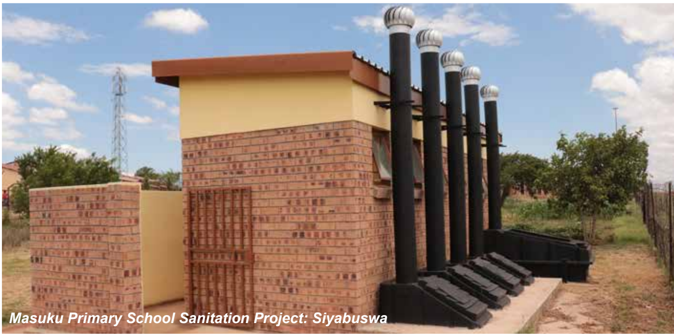
Masuku Primary School Sanitation Project: Siyabuswa