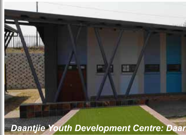
Daantjie Youth Development Centre: Daantjie