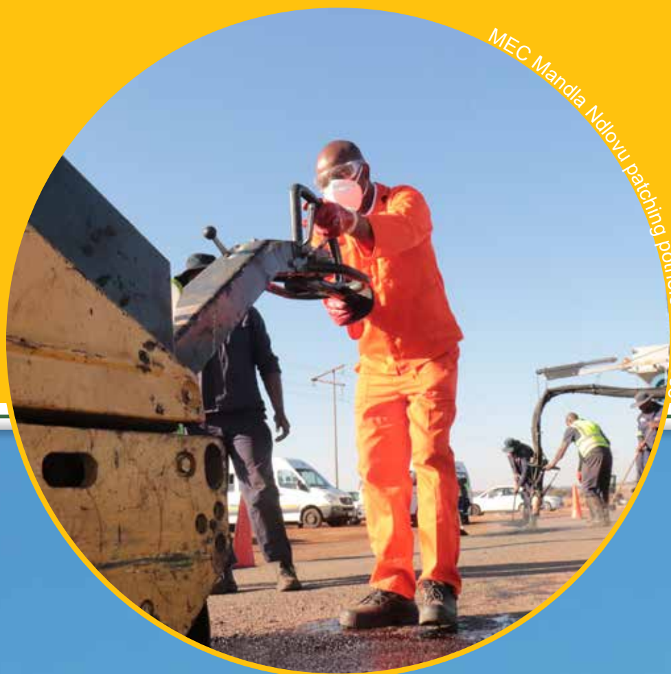
MEC Mandla Ndlovu patching potholes on R555